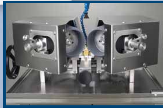
Shown with wheel guard removed